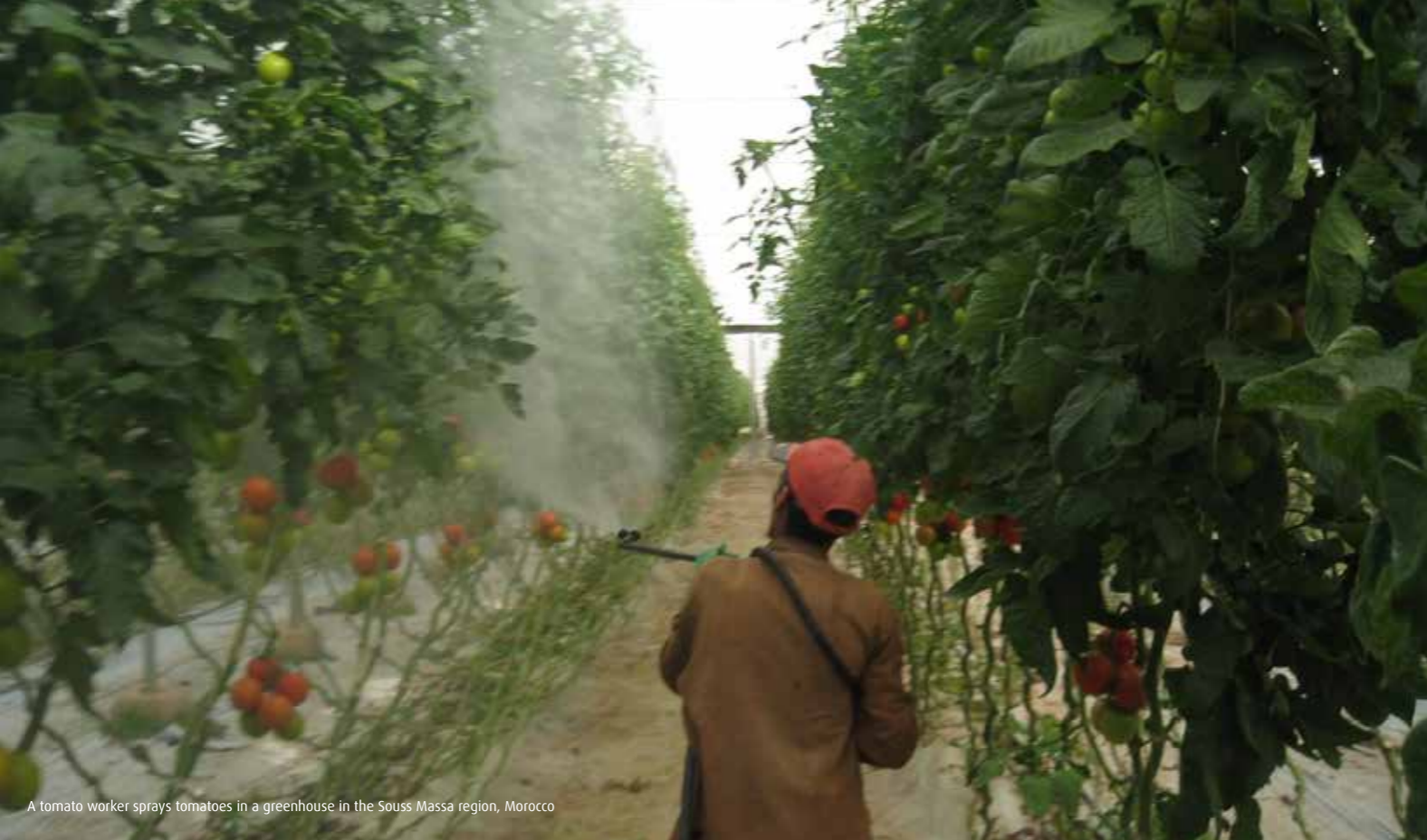
A tomato worker sprays tomatoes in a greenhouse in the Souss Massa region, Morocco