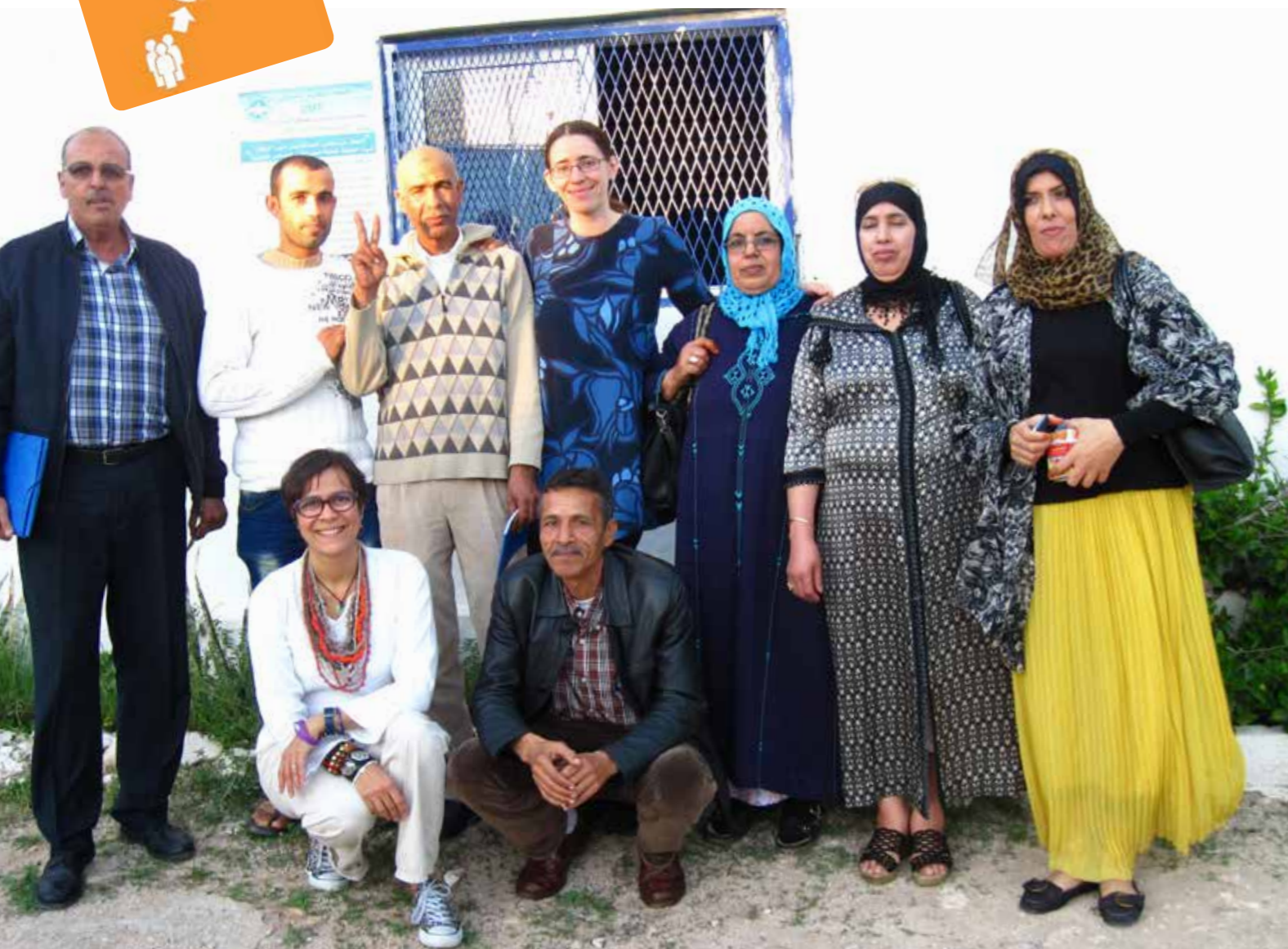
Fairfood staff meet with FNSA members to discuss what the project has achieved, November 2015, Agadir, Morocco

This building block relates to making tomato workers’ issues known at a global level, as well as working to bring about more widespread changes. For this purpose, the case of Moroccan tomatoes has been used as an example in policy discussions with retailers in order to create momentum for the implementation of living wages in all global food chains. This has involved the following activities: