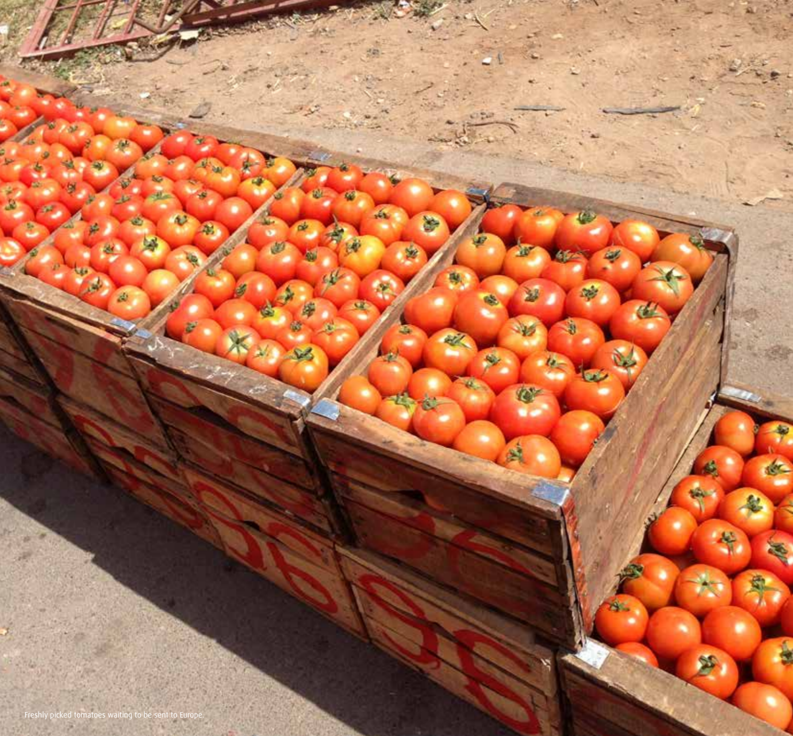
Freshly picked tomatoes waiting to be sent to Europe.