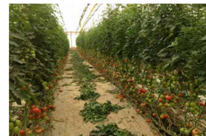
Tomatoes growing in a greenhouse

To collect information for this study, Fairfood has undertaken both desk and field research. It reviewed the project activity reports and conducted interviews with relevant stakeholders. This involved making a field trip to Morocco to talk to the FNSA, workers and other experts. In addition, Fairfood and the FNSA held a focus group in Morocco. This included several union members who are also agricultural workers and who have been involved closely with the project. It was an opportunity to discuss the main activities, to reflect on what had been achieved and to consider what could have been improved. These workers shared their personal stories and discussed the significant changes in their lives since the start of the project.