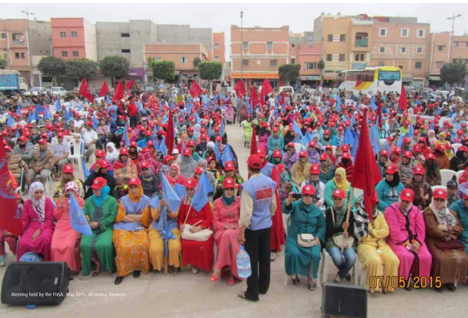
Meeting held by the FNSA, May 2015, Ait Amira, Morocco