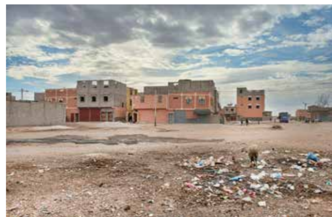
A village in the Souss Massa region, Morocco

The FNSA recognises the need for both national and international solidarity to achieve its objectives. It engages with its members and with external supporters to support agricultural workers who live and work in very difficult conditions.